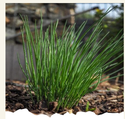
Ready for harvest

Chives are perennials, meaning they will come back year after year.