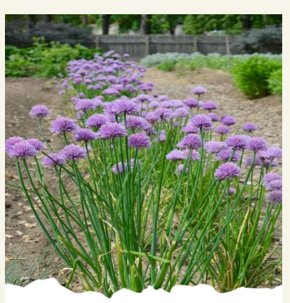
Chives in flower