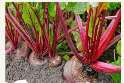
Ready for harvest

Don't let your thinned out seedlings go to waste. They can be eaten in salads and are known as microgreens.