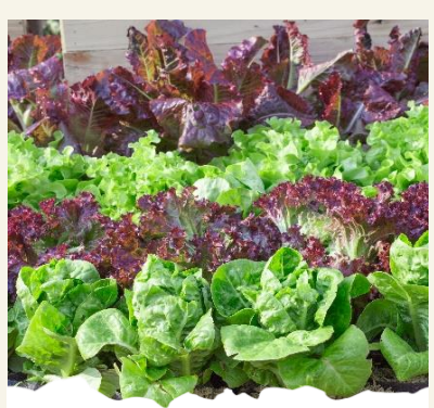
Ready for harvest