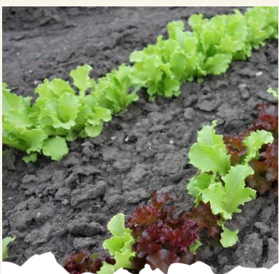
Seedlings before thinning

If you leave the plants to mature they will 'go to seed' and crops will have a bitter taste. You can choose to leave them for seed collection once the plant and flowers have dried.