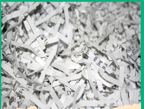
Shredded newspaper & cardboard