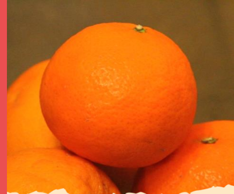
Citrus fruits or peels