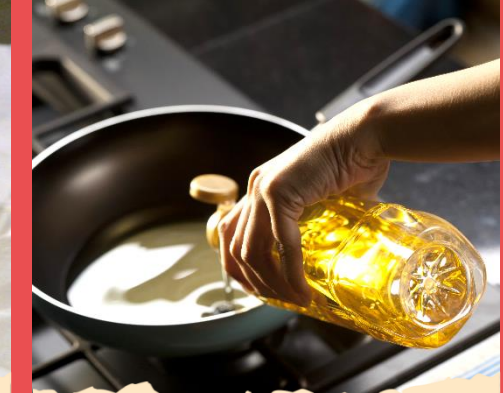
Fats or oils