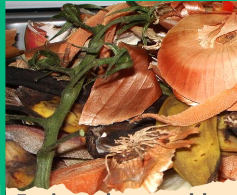
Fruit and vegetable peelings