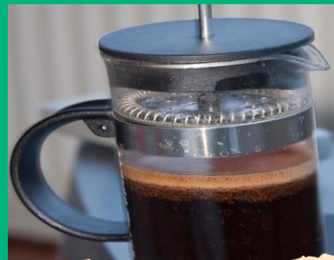
Tea & coffee grounds