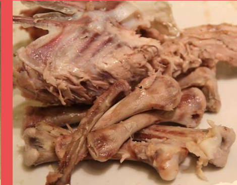
Meat, fish or bones