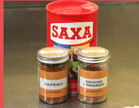
Sugar, salt or spices